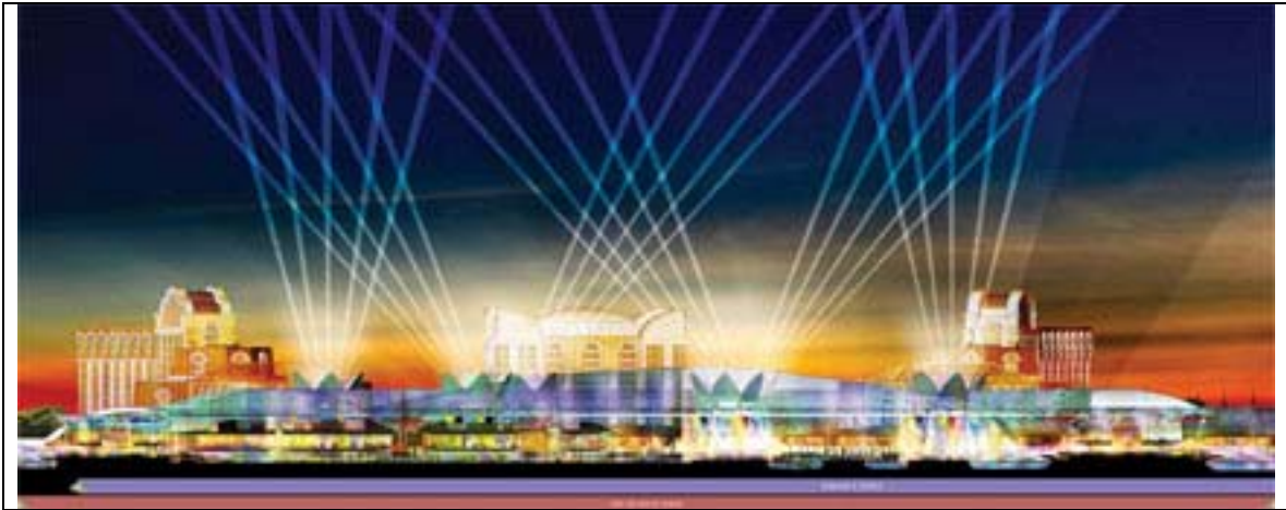
MYRIAD WORLD RESORT

The following is a brief introduction to a solid investment opportunity which capitalizes on the phenomenal growth of the Casino and Tourism Industry . The project features vision and scope, where imagination and size will come together to create the next tourism capital. Lead by a business savvy, charismatic and common sense oriented CEO and supported by an exceptional Board of Directors, the Company is poised to take advantage of the great business development opportunities created. This investment will enable Myriad Resort of Tunica, LLC, branded as Myriad World Resorts (“MWR”), a development stage company, incorporated in the State of Mississippi, to become the second largest gaming complex in North America. MWR’s core business is Amusement and Entertainment and it is poised to become the largest player in Tunica, the South’s Casino Capital and America’s 3 rd largest gaming region. In the next few pages, Sherwood & Associates (S&A) is pleased to outline the opportunity, in detail, and confirm, for investors with vision, that this project is a must for their portfolios.