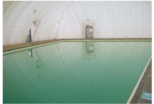
Pulaski YMCA, Winimac, IN