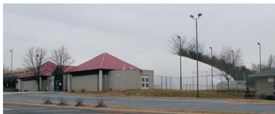
YMCA Delaware, Newark, DE