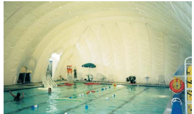
The Valleywood Club, Toronto, ON