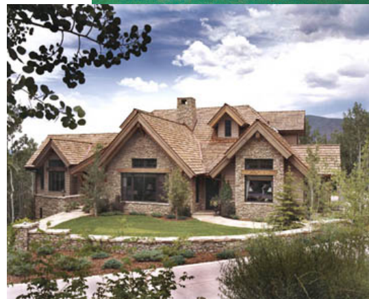
LUXURY LAKEFRONT ESTATE HOMES