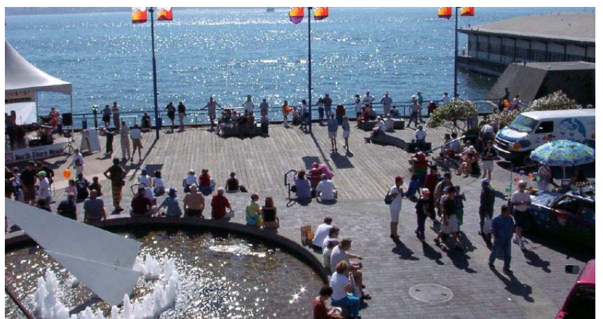
THE PIAZZA ON THE LAKE