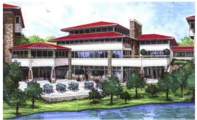
LAKEFRONT CONFERENCE CENTRE ATTACHED TO HOTEL COMPLEX