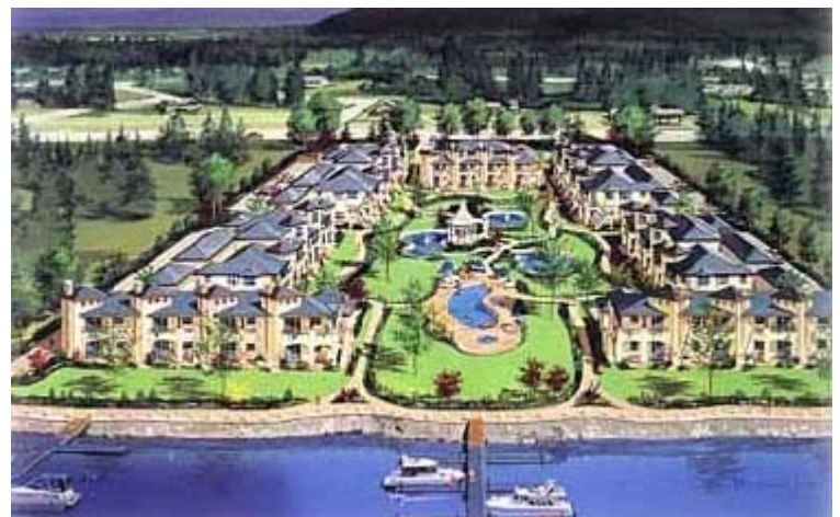
Luxury townhome complex on the waterfront east of the pier