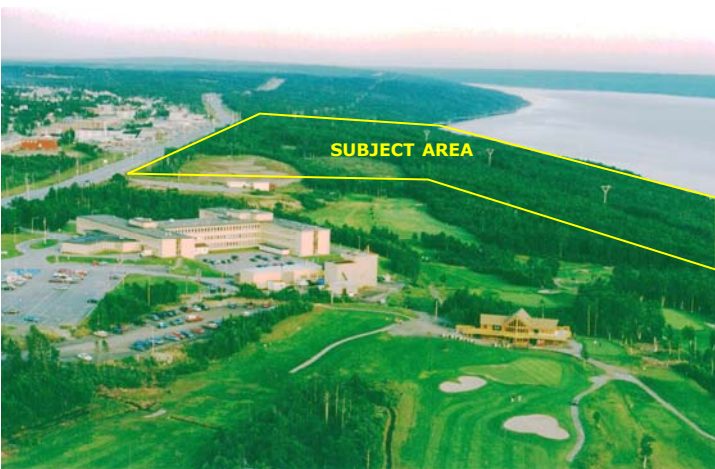
Golf Course, Paton Hospital and Subject Area