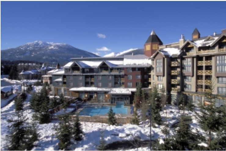
LAKEFRONT HOTEL/CONFERENCE CENTRE COMPLEX