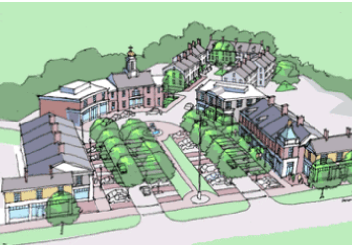
Retail Village & affordable housing in centre of masterplan