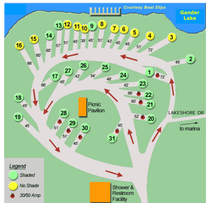
RV Park at the east end of the project

The economic benefits for Gander and Newfoundland are many indeed. The creation of mixed residential properties will create additional important revenue for Gander. New businesses will flourish. Gander will be in a position to offer and import new types of businesses from other regions of Canada and the Province, not to mention internationally. Implementing this master plan will help lure these business entities to Gander. After all, what fortune 500 corporation will want to locate a branch or profit center in Gander when there are only limited fixed and rental accommodations? Having a Resort, entertainment and tourist district combined with a waterfront/golf residential community will be an attractive incentive and one that is not offered at the present time. Build it and they will come.