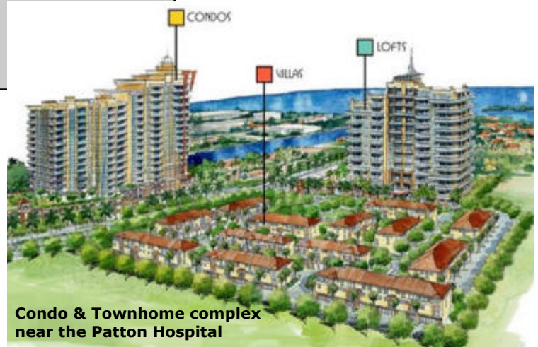
Condo &amp; Townhome complex near the Patton Hospital

Provisions for maintaining the character of the region should be enshrined in the city bylaws, so the vision can be maintained in perpetuity. This includes the creation of public parklands and trails, as well as, developer's financial contribution to many socially related issues.